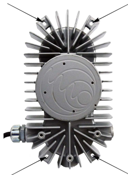
Surface Mount (Built-in)